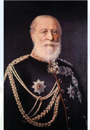
General Johann Jacob Baeyer